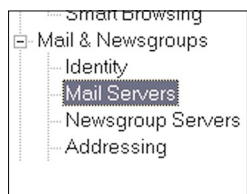
Step 1. Select Mail Servers.