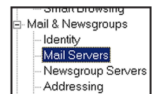
Step 1. Select Mail Servers